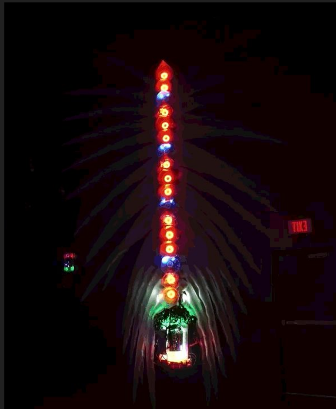
VT-34-BTB (Red Angel Eye), 2017