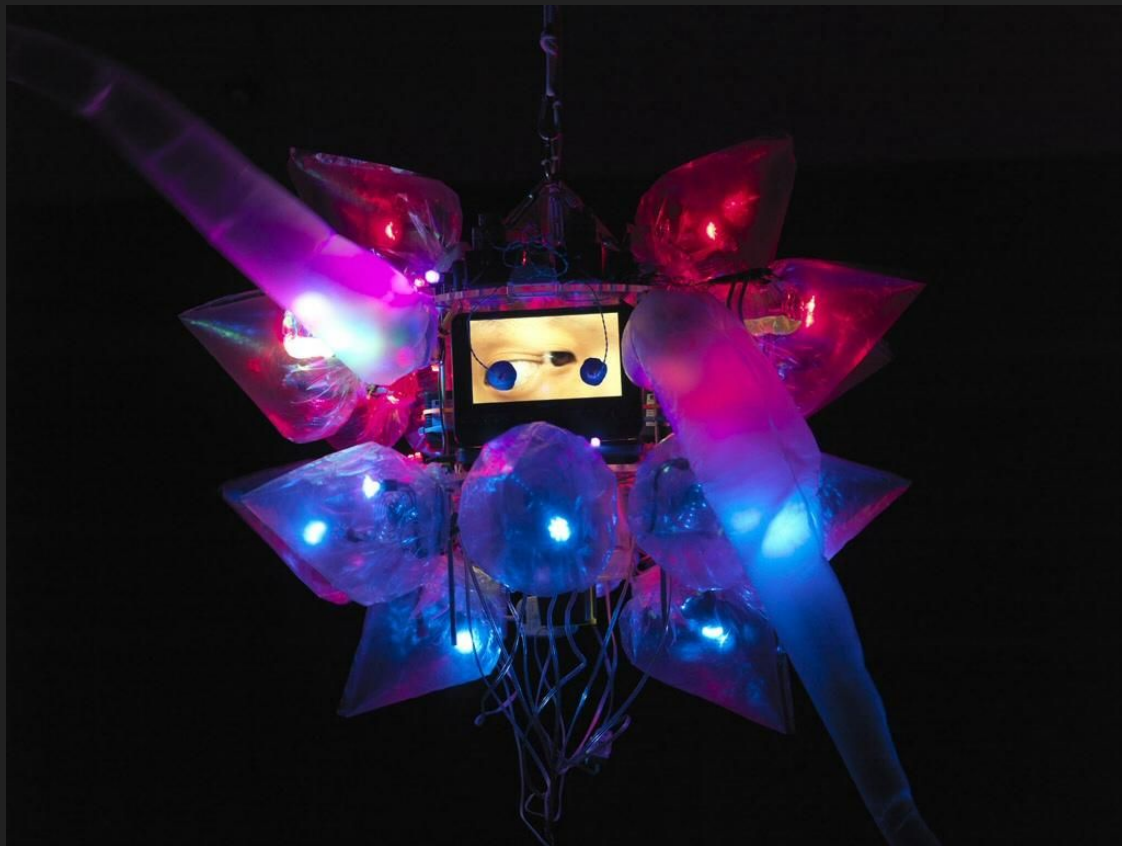
Connected: Eject before disconnecting, 2009