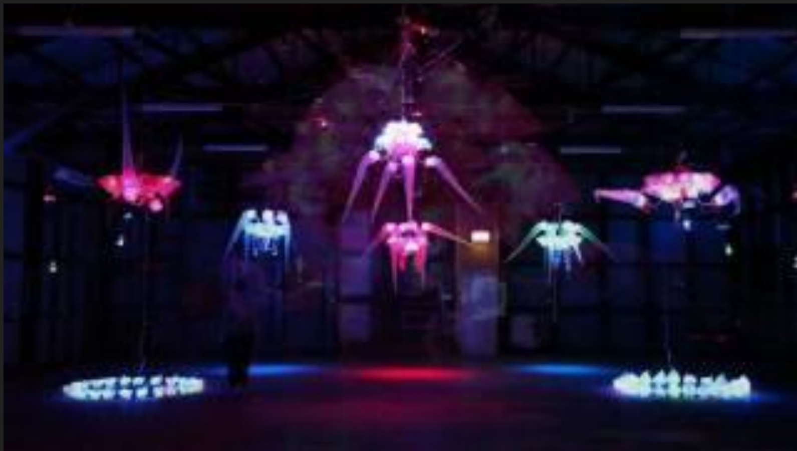
Cubozoa-L-09 2009, Brisbane.