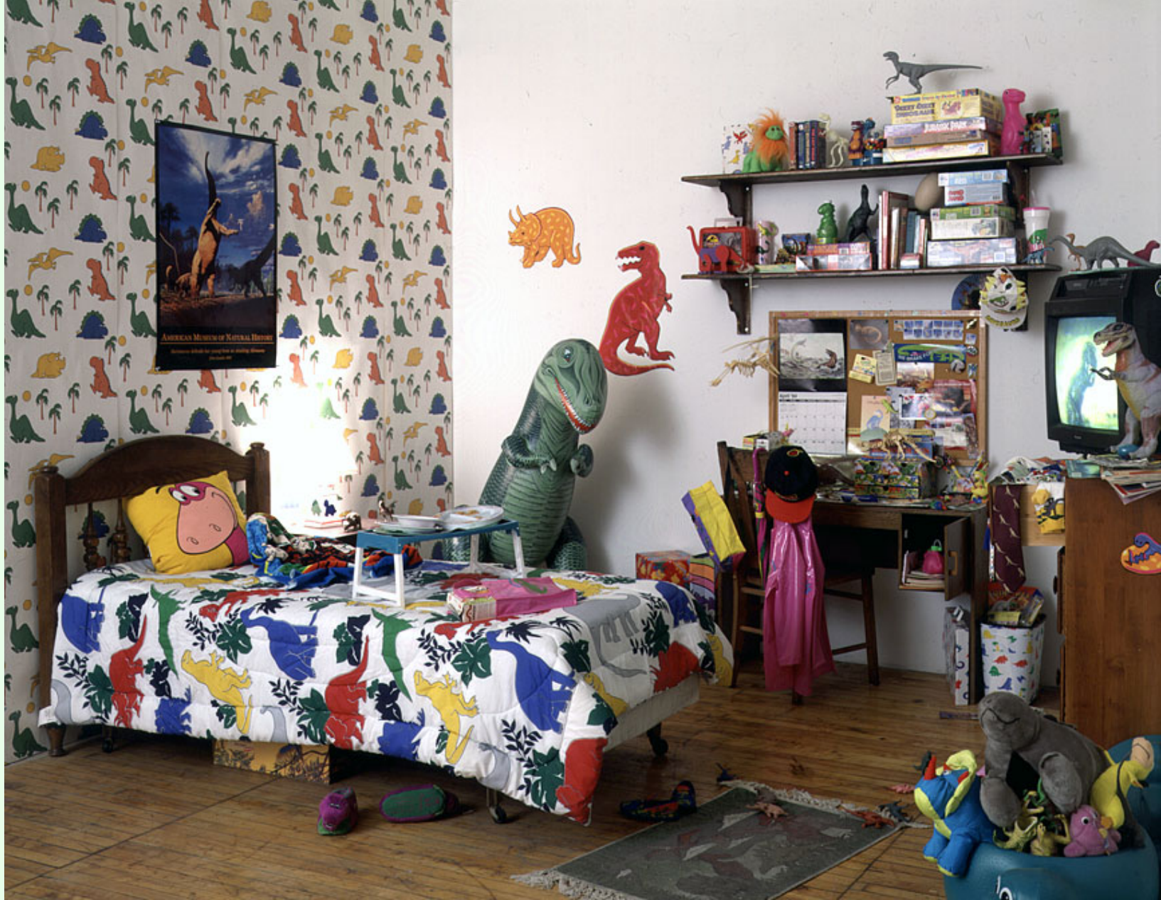
"Toys R U.S. (When Dinosaurs Ruled the Earth)"1994