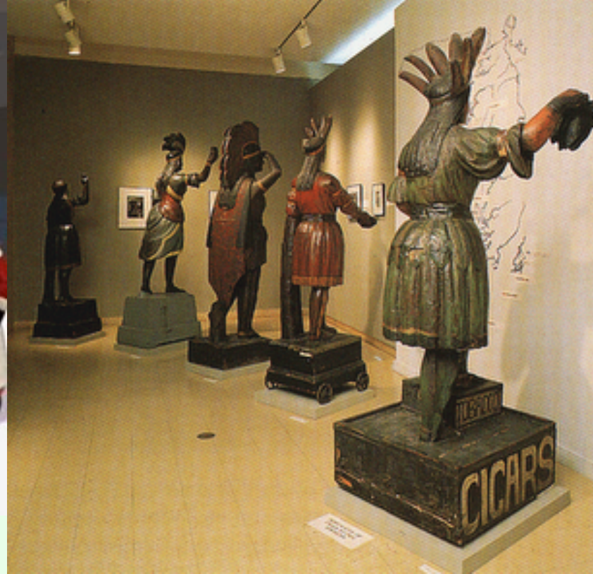
"Mining the Museum," The Contemporary and Maryland Historical Society (MdHS), Baltimore, MD