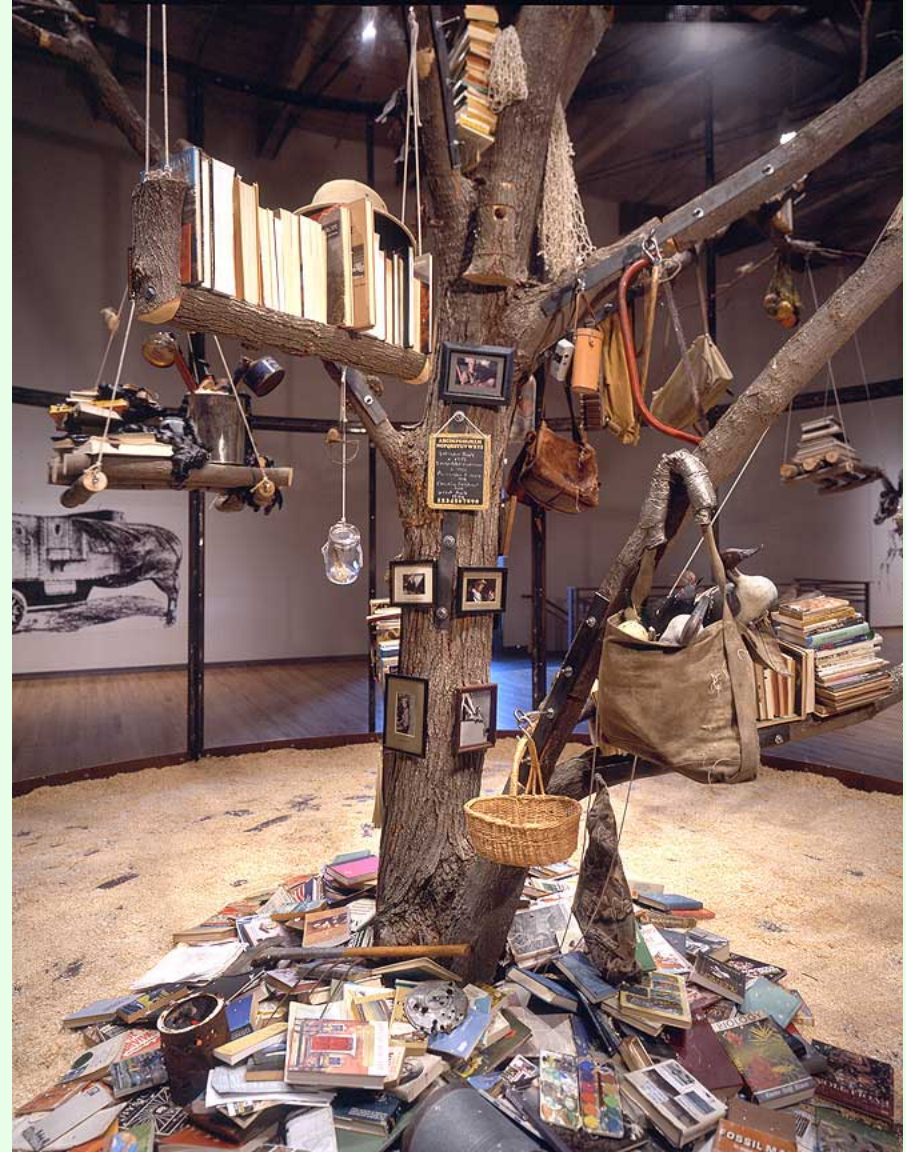
"Aviary (Library for the Birds of Massachusetts)", 2005. Tree and found objects, dimensions variable Installation view MASS MoCA, North Adams, Massachusetts