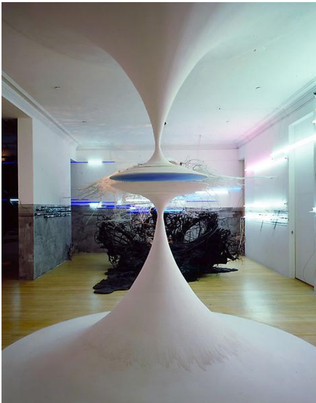
Buckets of Rain, 2006, Installation at Ameringer | McEnery | Yohe