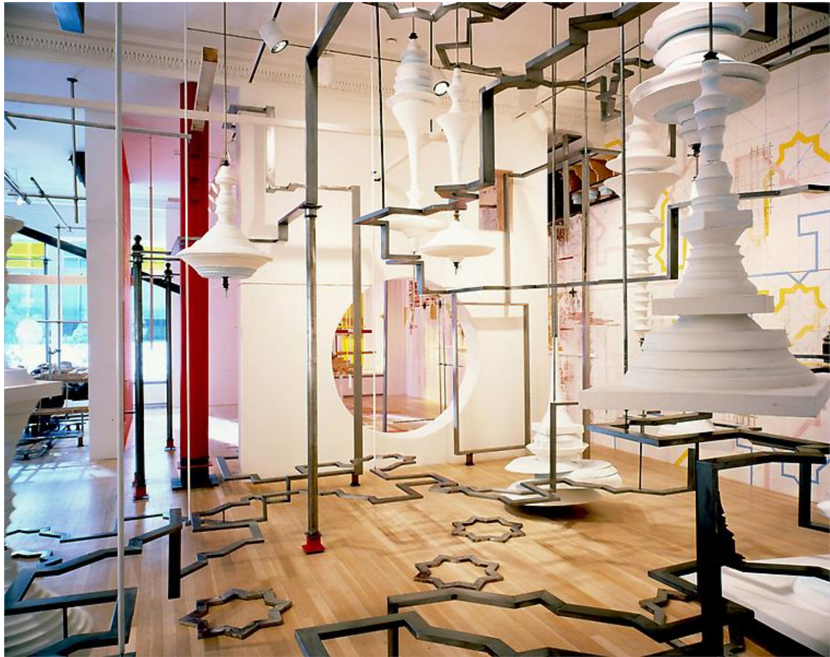
Neither Here Nor There, 2003, Installation at Ameringer | McEnery | Yohe