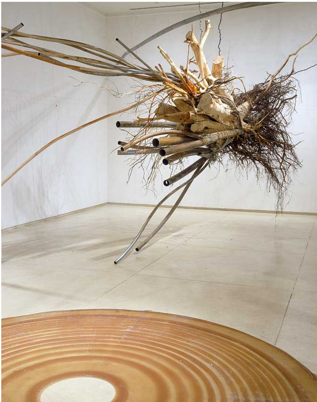
Round Hole, Square Peg, 1997. Mechanical steel tubing, plaster, pigment, wood, tree stumps, cast rubber, expanding urethane foam, and pencil.