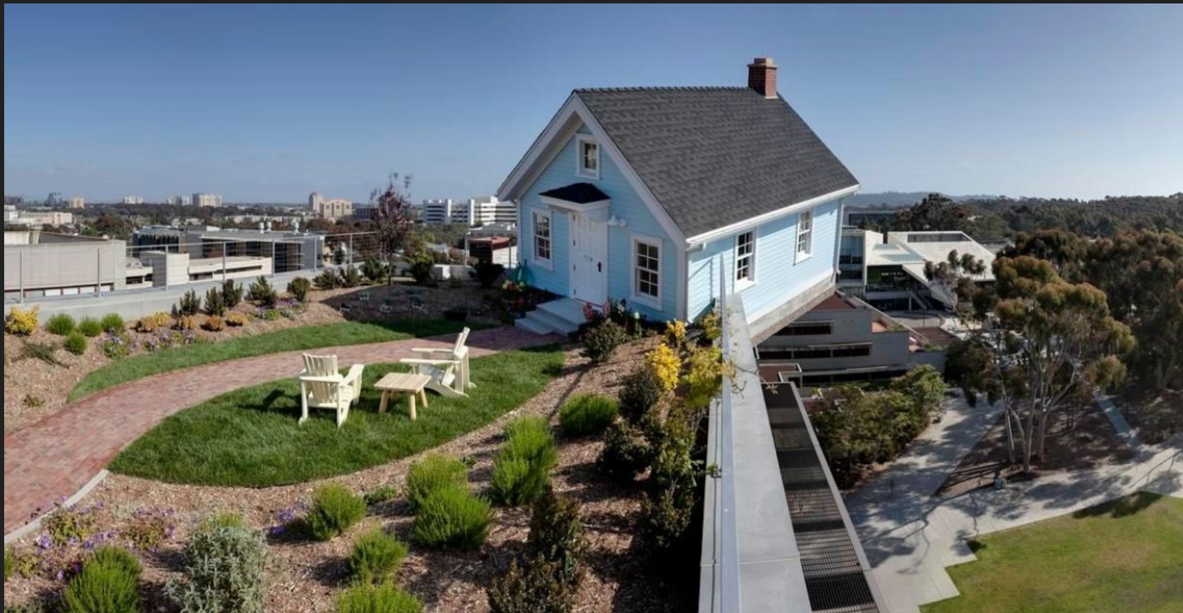
Fallen star (2012)