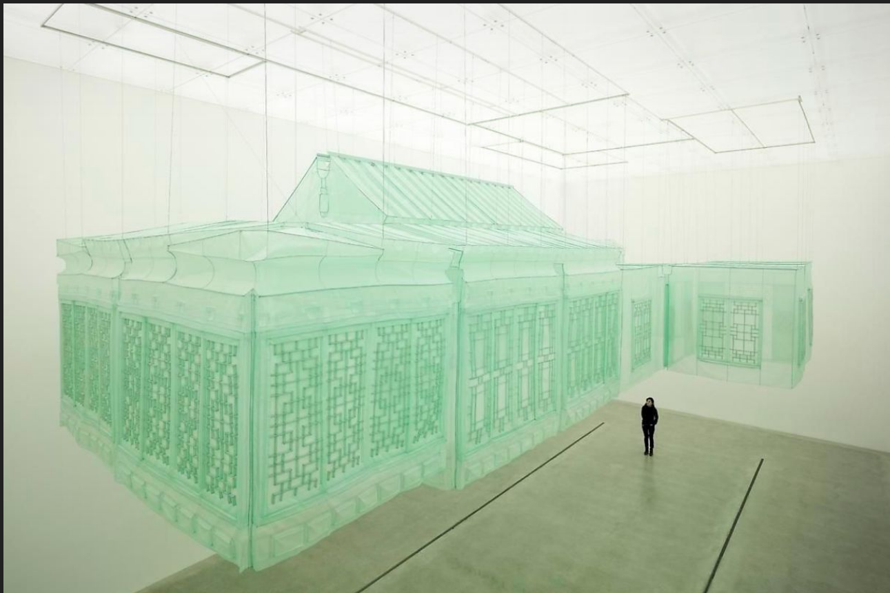
Seoul Home (2012)