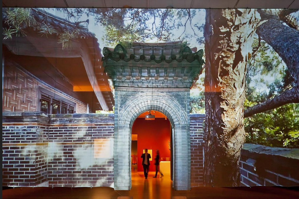
Gate (2001-2012) Polyester Fabric, Metal Frame, Video Projection