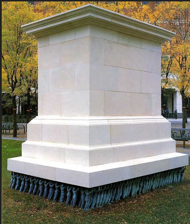
Public Figures (1998)