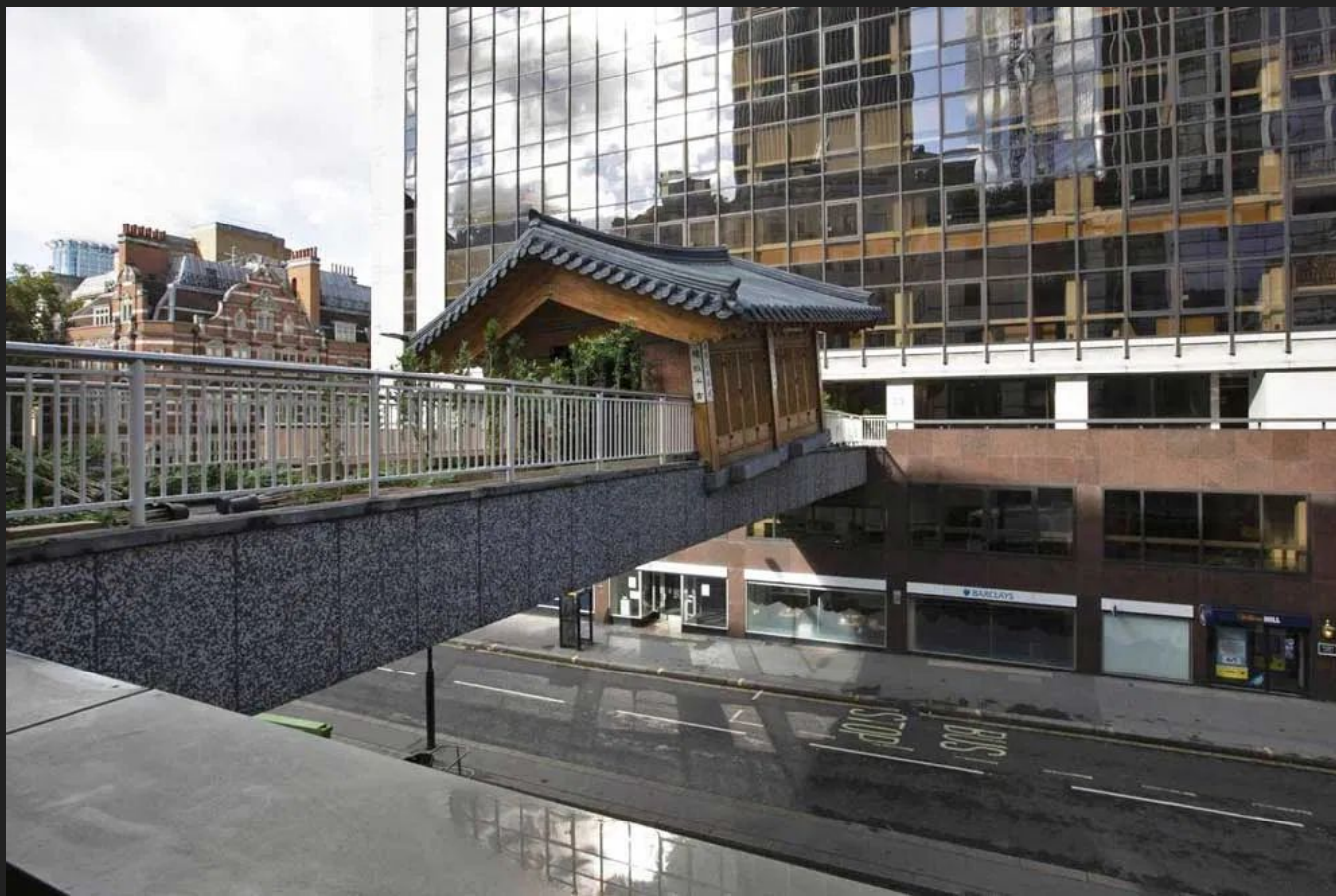
Bridging Home (2018)