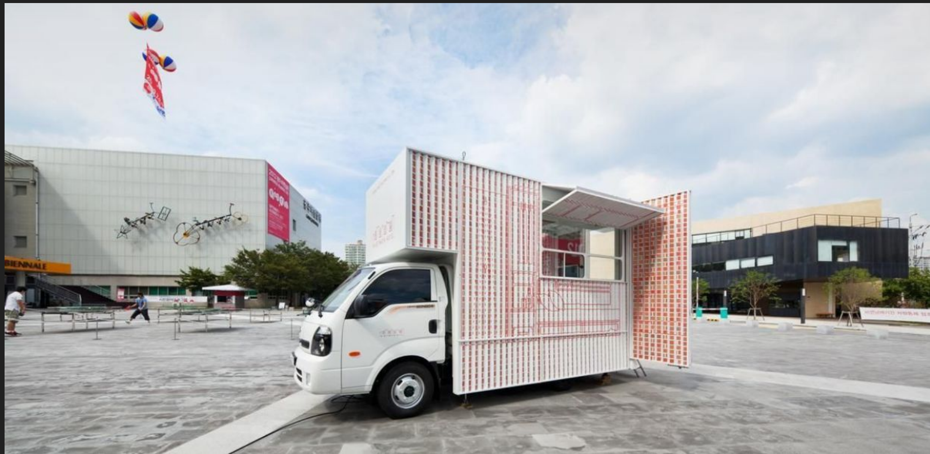
In Between Hotel (2012)