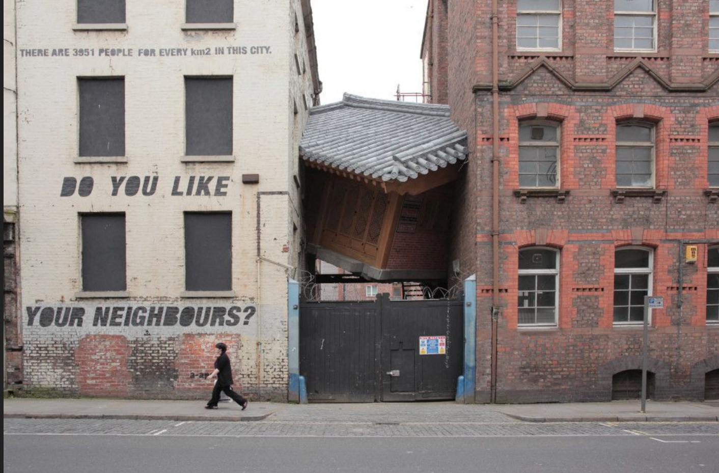
Bridging Home (2010)